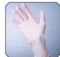
Class 100 Nitrile Gloves