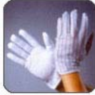
With PVC Dots