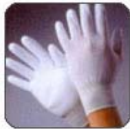
Palm Fit (Normal)