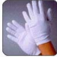
With PVC Coating

These ESD Gloves are made from high quality material and have excellent workmanship. They are suitable for normal or less stringent controlled environment. They also come in special coatings on the palm of the glove to provide better grip while wearing them.