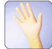
Class 100 Latex Gloves

Both types of gloves are available in lengths of either 9 inches or 12 inches, with S, M and L sizes.