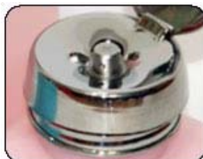
I-Tek Anti-Splash Solvent Dispenser

The XDC10A is a Zoom Inspection Scope which provide high quality colour image when works together with CCD I-Tek soft-touch solvent pump dispenser is designed for a clean and easy one-hand operation. The dispenser has an attached hinged lid to keep out impurities when the container is not in use. The dish-shaped reservoir holds and contains dispensed solvent. The entire pump system is made of stainless steel which can withstand the use of aggressive solvents.