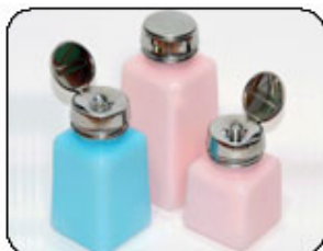
I-Tek Regular Solvent Dispenser

Anti-Splash Dispensers: SD120AS, SD180AS, SD240AS