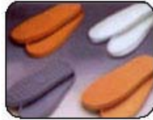
Static Control Soles