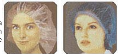
Sizes Available: 19" & 21" Colours Available : White, Blue, Green, Pink, Yellow

Bouffant and Mob caps are worn to prevent contamination from shed hairs in a controlled environment. They are manufactured and packaged in a clean environment. These caps are made of 100% Non-woven spunbond polypropylene fabric.