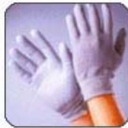
Palm Fit (Grey)