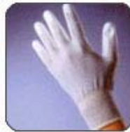
Conductive Palm Fit

Top Fit Gloves are made from 100% nylon are coated with polyurethane on the fingertips. Palm Fit Gloves are made from 100% nylon with polyurethane coating on the palm. The polyurethane coating on the gloves provides an anti-slip and anti-cut surface.