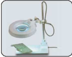
QF - N5 - N8